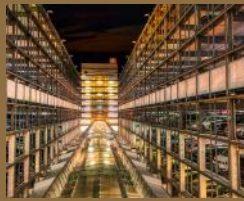
MULTILEVEL CAR PARKING